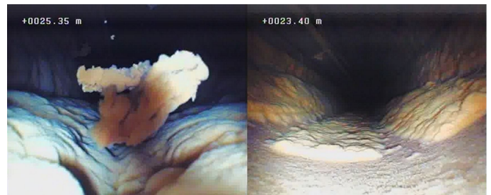
A downhole view of a well clogged with Iron related bacteria

Martin Preene of Preene Groundwater Consulting and Mike Deed of Geoquip Water Solutions presented a paper at the XVI ECSMGE Conference in September on managing the clogging of groundwater wells in civil engineering schemes. The full paper can be read on the Geoquip website. Groundwater wells are common to many civil engineering schemes, used for construction dewatering, open loop geothermal systems or alternative water supplies for buildings and facilities. Well performance must be optimised and high levels of operational efficiency and service availability achieved. Yet, the benefits of proactive planned maintenance of