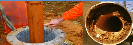
BOREHOLE CLEANING PRODUCTS • WELL CAMERAS • PUMPS